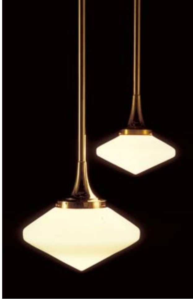
Shown with 14PD and 10PD shades in PBL finishes